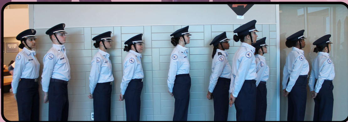
Cadets are lining up to prepare for inspection