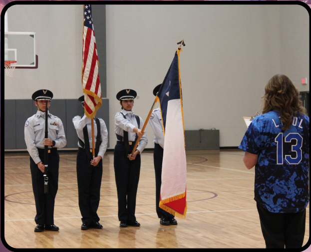
Color Guard is presenting colors

On February 28, 2026, the Waller High School Drill Team proudly competed in the Waller HS Drill Meet, where they participated in a series of challenging and exciting events. Throughout the competition, the team demonstrated outstanding teamwork, discipline and while performing with confidence and precision. Their commitment and determination paid off as they showcased their school with pride, making the entire team's effort a great success.