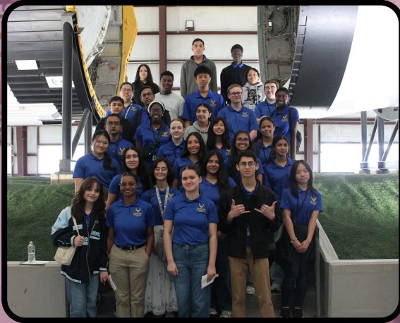
The cadets are posing for the group picture

On March 11, 2026, the cadets attended their CIA trip at the Space Center Houston, where they had the opportunity to explore and learn more about space exploration, technology, and science. Throughout the trip, cadets experienced interactive exhibits and educational activities that helped expand their knowledge about NASA and the history of space travel. This trip provided an exciting and valuable learning experience while allowing cadets to discover more about the science and innovation behind space exploration.