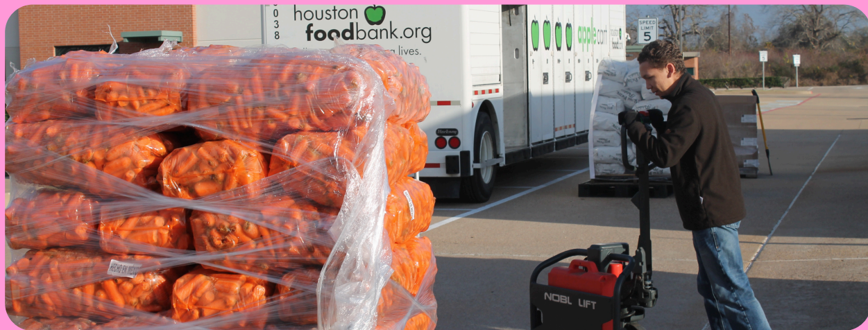
C/Castro is helping out at the local food drive!

All Star Battle Cup RPC - May. 16th EHS Graduation -June. 1st