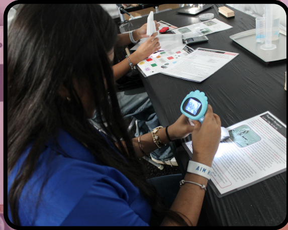
Cadets are calculating the density of a moon rock