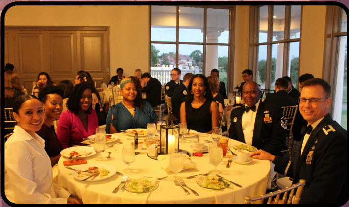
The counselors are posing for the picture.