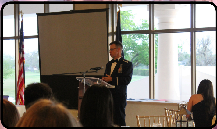
Captain is giving his opening speech

At the end of the year, the ROTC program held its annual banquet, the Military Ball , to celebrate the accomplishments and dedication of the cadets throughout the school year. The event brought cadets together for an evening of recognition, celebration, and memorable moments. During the banquet, cadets were honored for their hard work, leadership, commitment, and achievements shown all year long. The Military Ball served as a special way to recognize the effort and dedication each cadet contributed to the program while creating lasting memories with their fellow classmates and instructors.