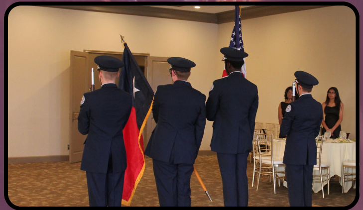
Color Guard is presenting colors