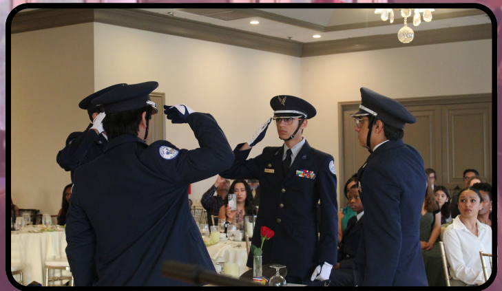
The POW/MIA Table is presented by C/ Leon, C/ Arya, C/ Lan, C/ Mathur